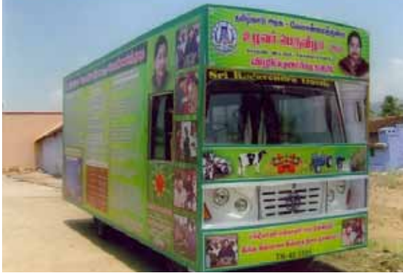
Fig. 3.1.7: Propaganda Van

through 'Mobile Extension Centre Approach' operated and executed by the officials of agriculture and allied sectors and other stakeholders like input suppliers, bankers. All the stake holders spent one whole day with farmers to disseminate information and technologies. Integrated Farming System is being popularized during the mass contact programme. The information was disseminated through Street theatres, folk dance, songs, workshop with focus on the local farm problems and appropriate solutions. Various demonstrations, Mini Exhibition, discussion, Audio Visual shows, Mini cattle health camps were also conducted. Besides, farmers' baseline data, soil testing, feed back on Government Farmers' Integrated Handbooks and Farmers Guide Books were also distributed to the farmers. Based on the success of Uzhavar Peruvizha, it is proposed to conduct mass campaign every year to serve the farmers at their door steps.