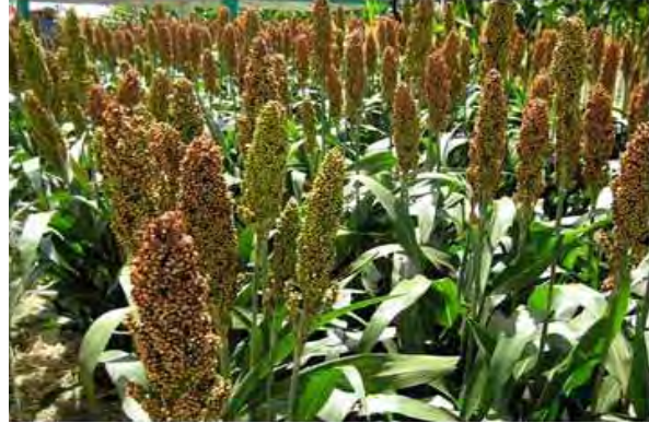
Fig. 3.1.4: Millet - Cholam