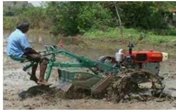
Fig. 3.1.5: Farm mechanization

sectors is observed in Tamil Nadu during the last decade. To increase the productivity of the land and to cope up with shrinking agricultural manpower, mechanisation is not only essential but also imperative. The constraints in promotion of mechanisation include non standardized agricultural practices, small and marginal land holdings, low investment capacity of farmers, lack of know-how and non availability of service and maintenance facilities. Policy and structural mechanisms shall be developed to address these issues and support increased mechanisation in all phases of agriculture (Vision Tamil Nadu 2023).