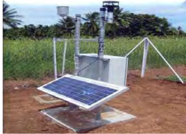
Fig. 3.1.6: Automatic Weather Station

to provide medium range weather forecast to carry out agriculture related activities by the farmers in time and also to provide weather data to the insurance companies. TNAU was consulted to devise location-specific weather based crop insurance products. Sensitization programmes were conducted to bring awareness about the products.