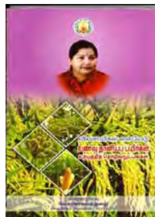
Fig. 3.1.2: Farmers guide booklet