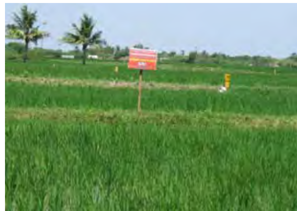
Fig. 3.1.8: Paddy Field

Apart from the above, a separate provision of outlay in case of IFS, multiplication and distribution of seeds, distribution of inputs especially tractor and machinery, establishment of food processing units, cold storage units and coverage of crop/weather insurance scheme and other welfare schemes.