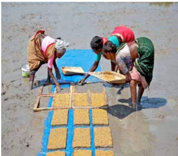
Fig.3.1.3: Raised beds for SRI

Synergy of the recommended twelve critical steps of SRI, when adopted in toto, would lead to considerable increase in rice yield. In SRI, alternate wetting and drying is an important step to ensure root aeration. SRI should not be adopted where soil and water conditions are not suitable like low lying areas. While SRI adoption has been given more emphasis in the Twelfth Plan striving to achieve the target of 16.50 L. ha, care has to be taken to spread the SRI in the suitable areas only.