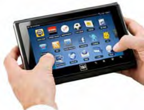
Fig. 3.1.1: Personal Digital Assistant (PDA)

the present level, it is proposed to increase the cropping intensity, irrigation intensity, productivity by 50 percent and above and bringing fallow lands under cultivation. The Government has taken initiatives to ensure scheme benefits reach the farmers directly in a transparent manner. As a first step, to ensure sustainable agricultural production, the Department of Agriculture has envisaged farm level interventions through “Farm level planning”. The prime objectives are to enable farmers to adopt improved cultivation methodology and techniques in their landholding, to provide linkages and easy access to critical inputs in time, enable farmers to use most appropriate farm machinery to reduce drudgery, labour cost and get higher production and productivity, to empower farmers with complete access to the information related to his farming operations, extension functionaries to become a friend and guide of farmers throughout the cultivation cycle. To achieve the above objectives, the following activities are to be carried out: